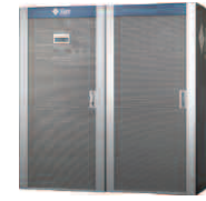
Sun SPARC Enterprise M9000 64 CPU