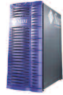
Sun Fire E25K